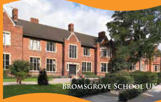
BROMSGROVE SCHOOL UK