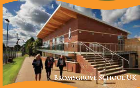
BROMSGROVE SCHOOL UK