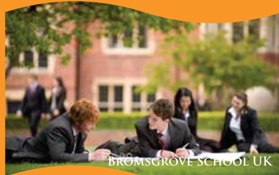
BROMSGROVE SCHOOL UK

Facebook: https://www.facebook.com/bist.summercamp